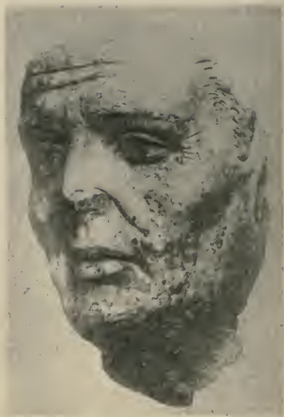
M. TULLIUS CICERO. FROM THE JAMES LOEB COLLECTION.